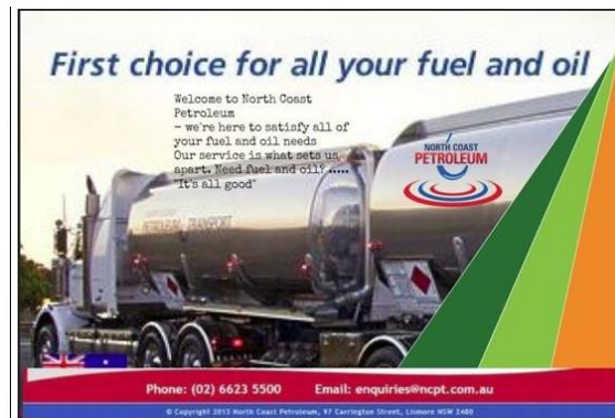
North Coast Petroleum